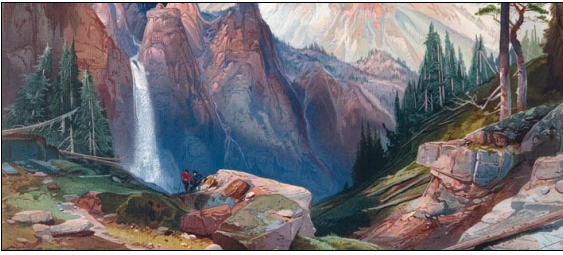
Thomas Moran, Tower Falls and Sulphur Mountain , ca. 1875 detail, chromolithograph

Please join us on Wednesday, Aug. 21st, for a visit to the Gilcrease Museum. Our main point of interest will be the temporary exhibit called "Yellowstone and the West: The Chromolithographs of Thomas Moran". Also, the museum will be showing additional Moran works that are not a part of the permanent exhibit.