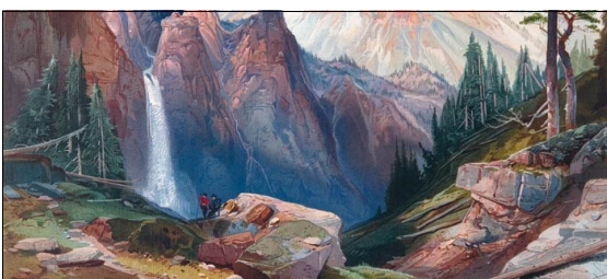
Thomas Moran, Tower Falls and Sulphur Mountain , ca. 1875 detail, chromolithograph

This month we will tour Gilcrease Museum on Wednesday, August 21st. Meet at the church at 10 a.m. Lunch will follow.