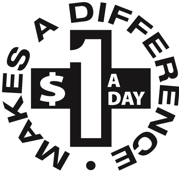
{ $1 A Day Logo }

One month into the campaign we can claim success. We were able to make a payment to Apportionments of $3250 at the beginning of March.